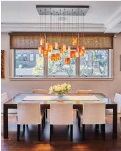
A BLOWN-GLASS CHANDELIER hangs above a Pottery Barn dining table (ABOVE) with chairs by Poliform. The living area (BELOW) is decorated with an antique Thai carved teak mirror and artwork from the couple's travels throughout Asia.