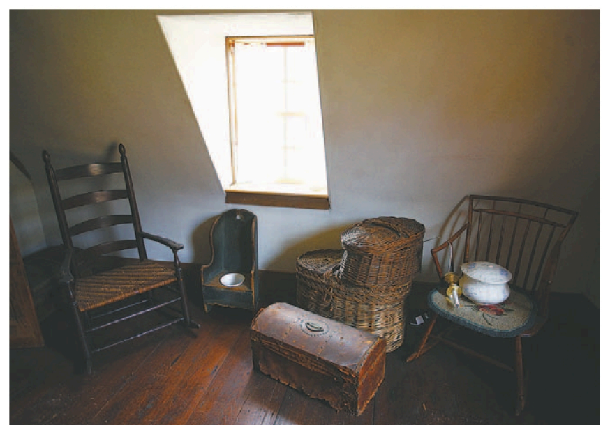
■ Artifacts from the second floor at the home in Weymouth have been preserved. At left, preservation carpenter Jon Folsom is working on new trim for the fascia boards on the home’s exterior.