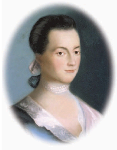
Portrait of a young Abigail Adams

Getting the bugs out of the Abigail Adams birthplace in Weymouth has been a big part of restoring the landmark to its former glory